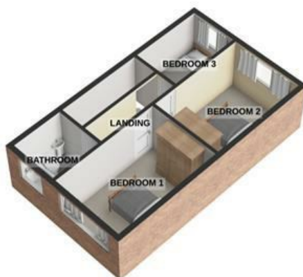
TOTAL FLOOR AREA : 1444 sq.ft. (134.1 sq.m.) approx.

For illustrative purposes only. Decorative finishes, fixtures, fittings and furnishings do not represent the current state of the property. Measurements are approximate. Not to scale. Made with Metropix © 2025